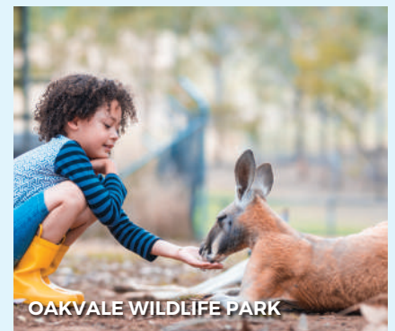
OAKVALE WILDLIFE PARK

Breakfast, Meals on Board We hope you enjoyed your vacation with our company and we look forward to seeing you again on your next trip.