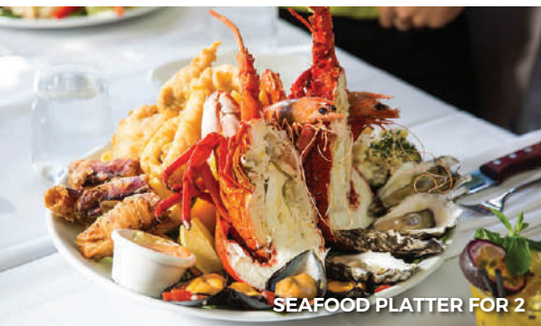
SEAFOOD PLATTER FOR 2